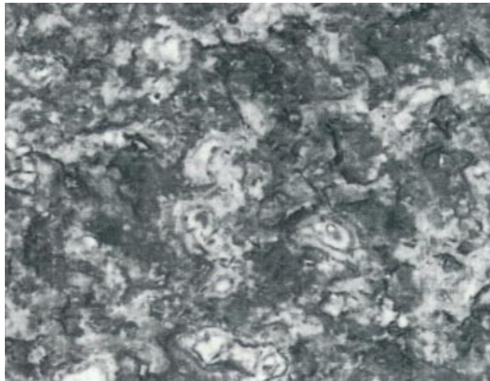
Fig. a: Rough surfaces of a paint layer. The topography is indicated by the formation of contour lines. Inclusions and pores show up clearly due to large differences in their grey levels. Frequency: 400 MHz, Image width: 1 mm

High acoustic penetration potential is required to penetrate thick layers of paint. This is achieved by using low frequencies, as the sound dissipation is then reduced. Working in the frequency range of 10 MHz to 2 GHz, the SAM 2000 produces high-resolution surface images, illustrated here by a paint sample, or non-destructive images of deeper layers, such as corrosion phenomena under the paint.